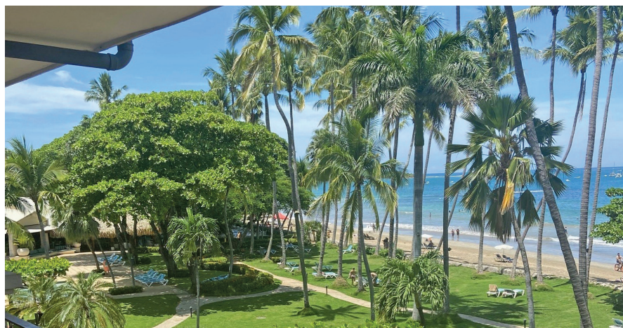
BEACH BUM – Palm trees, nicely manicured landscaping and a pristine beach hug the blue waters of the Caribbean Sea in Costa Rica.

We flew into Liberia airport and stayed at the Secrets Papagayo Resort – a stunning all-inclusive property with lush gardens on the gulf. The resort is large and hilly with a black-sand beach. It's a great getaway for clients who want an adults-only resort. It's a large spread-out property, not suitable if you have mobility issues. We also toured the nearby